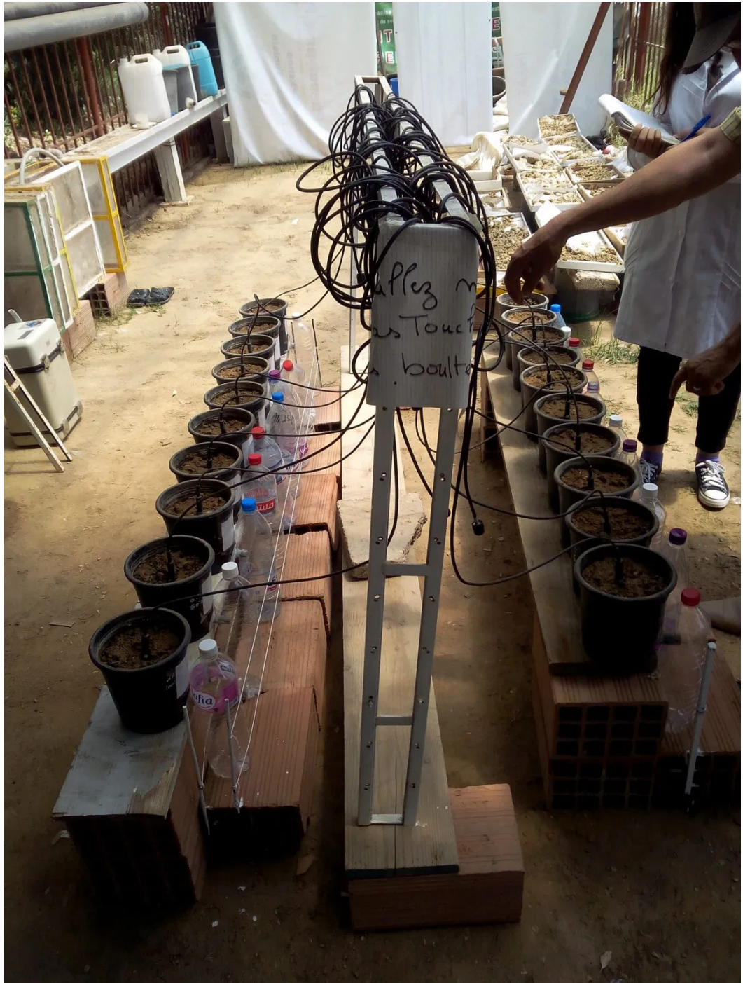
Experiment under way at INRGREF, Tunisia

Switzerland's Aqua4D have been gaining acclaim in salinity-blighted countries around the world from Brazil , California and the Middle East . This innovative water treatment efficiently reduces salinity in soils and negates the harmful effects of irrigating with saline water. The salts remain in the water but are so dissolved to such an extent that they no longer pose a danger or crystallize in the soil or around the roots.